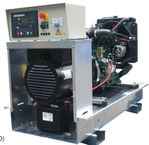
Open Set (LLD)