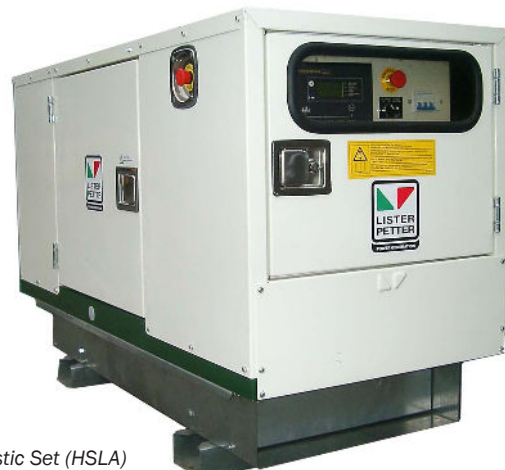
Acoustic Set (HSLA)